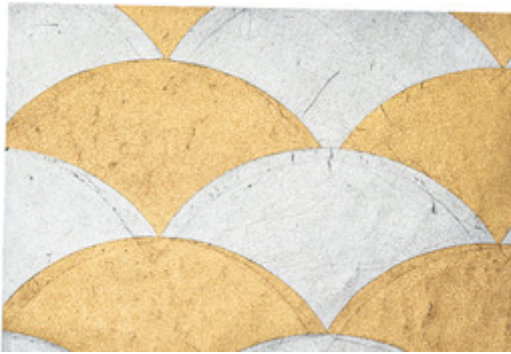
Gracie wallpaper's Handmade Mid-Century Metallics collection

"The windows here originally had chain-mail curtains—so cool! And the bases of the huge columns [not visible in photo] are wrapped in linked chain embellished with big studs. The more accessible, take-this-home-with-you version of that treatment is to accent with nailheads, a decorative element that you can even DIY; anyone who's studded their jeans can do it. They catch the light so fabulously. I use them to dress up pillows, table skirts, leather wall panels—even glued directly onto walls." She like King Richard's nails for upholstery and walls, kingrichardco.com .